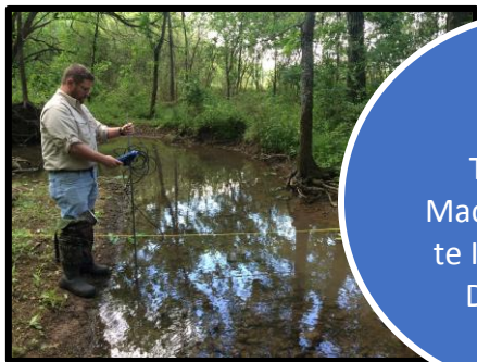
Figure 3: Puckett Creek within protected buffer near Fortress Blvd